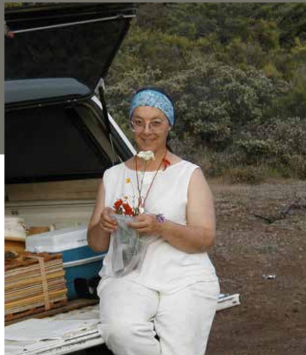
Napa County, 2022.