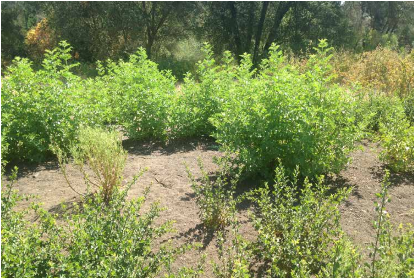
Blue elderberry ( Sambucus mexicana ) regrowth following a cultural burn.

More and more of the world's leaders are recognizing the need to give back to nature rather than just take, as well as the important role of Indigenous Peoples in that stewardship, both in the past and today. Prior to colonial contact in California, the land was well-taken care of by the Native American Peoples both before and shortly after the Euro-American arrived. The Euro-Americans reaped the rewards of giant trees and timber for their operations in the latter 1800s here in California, but they never restored and never put back—they just took. Then in the early 1900s they did the opposite. They did not allow fire in the forest, instead planting thousands of trees and never “tending the garden;” they just let the trees grow. This inconsistency of managerial practice, targeting the economy